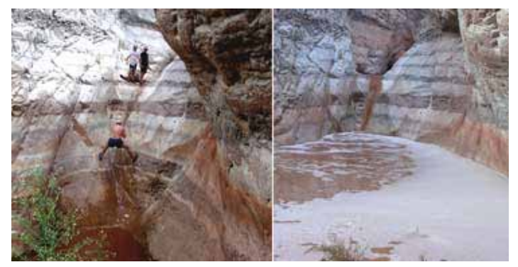
Silver Grotto - Before/After Flash Flood, same view

one bolt seemed to rip the air from rim to rim, right above our heads.