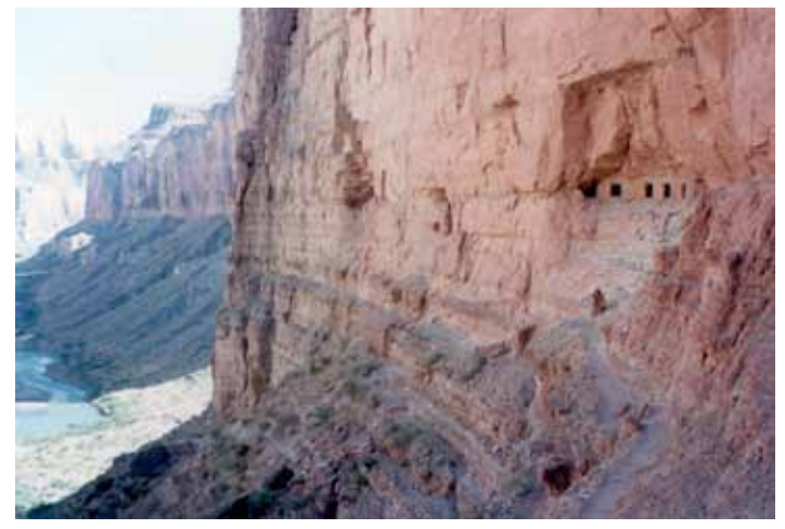
Anasazi Granary at Nankoweap

The outfitter had warned us that the takeout road is really a streambed called Diamond Creek. If a big rain comes, a flash flood could occur trapping you at the takeout for hours or even days. When we got to the takeout, the skies were BLACK. We just got loaded up and were driving out when it started to rain. Luckily we got out without a problem. I saw on the on-line gauge for Diamond Creek that 2 hours after we drove out, the normal 10 cfs creek got up to 4000 CFS, and did not get low enough to drive in or out for two days. The God's must be crazy, but still love us; we sure lucked out this time.