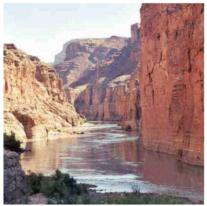
The beauty of the Grand Canyon

and origin that causes itchy, burning red spots on the feet. Eleven of the group got it; one so bad that he was not able to take hikes. The infection is thought to arise from prolonged exposure to water, sun, and sand.