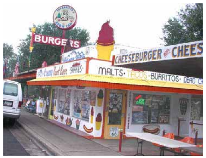
Our First Stop - Snow Cap - RT66 Tourist Trap

Slide Show of 2006 trip by Bob Nicholson - A Big File